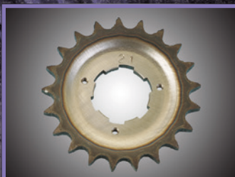
Final Drive Chain Sprockets