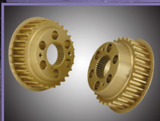
Final Drive Belt Sprockets