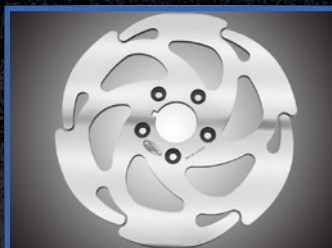
Disc Brake Rotors