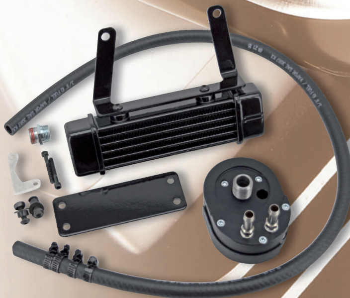
Jagg Lowmount Oil Cooler for Softtail